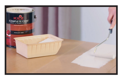
PROTIP: For glossy surfaces, scuff sand with the appropriate sandpaper prior to coating.